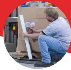
Secure corner boards