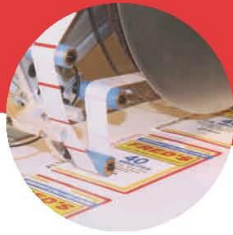
Attach gift cards